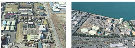
A scene from sewer pipe cleaning Kitaminato Water Purification Plant (Wakamatsu Ward) Shinmachi Water Purification Plant (Moji Ward)

As of the end of FY2018, 34 pump stations are in operation. In Kitakyushu City, 5 sewage treatment plants (final sewage treatment plants) are currently in operation and the total volume of sewage being treated a day is about 410,000m 3 , which is about 5 times the volume of the city hall building.